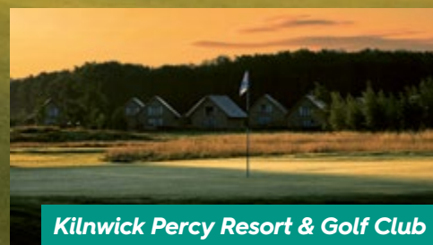
Kilnwick Percy Resort & Golf Club