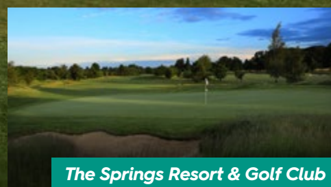
The Springs Resort & Golf Club